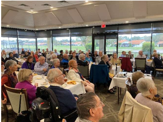
Members listening intently