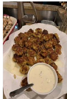
Mini Crab Cakes