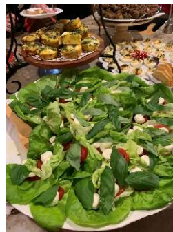
Caprese Salad & Devil Eggs