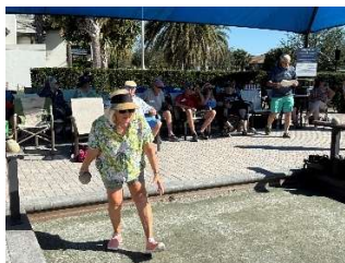
Let the play begin!