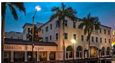
The Sarasota Opera House

INVITATION: The Board is pleased to invite you to the first cultural event planned by our newly established GCICS Program Committee.