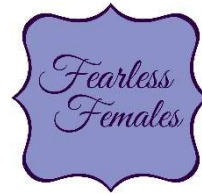
Women's History Month