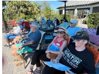
Watching the play.